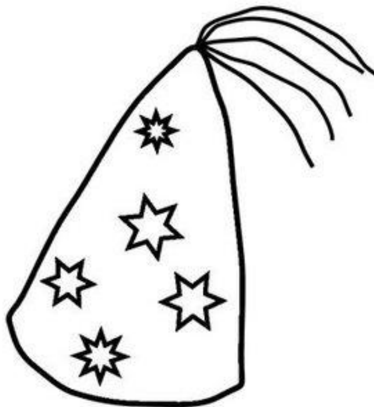
The wizard hat is a cone.