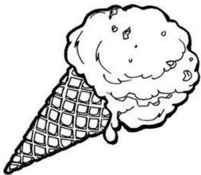
The ice cream cone is a cone.