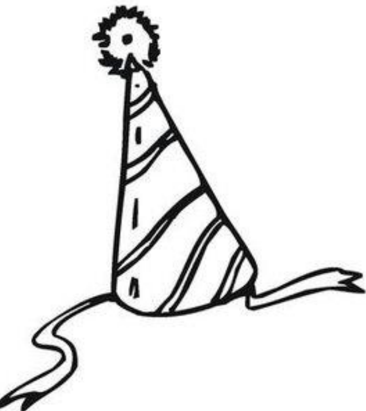
The party hat is a cone.